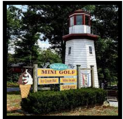
(Left) Farm 23 BBQ & Bottle Drive, (Center) Animal House, (Right) Dolphin Mini-golf BBQ & Bottle Drive